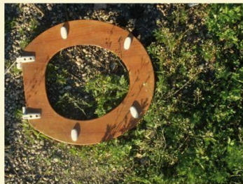
FOUND: May 21 2009. 5.58pm. 182 Moore St. OBSERVATIONS: Fake wood and cream plastic.