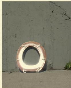
LEFT: May 28 2009. 4.59pm. 48 Thames St. OBSERVATIONS: From feces to gold.